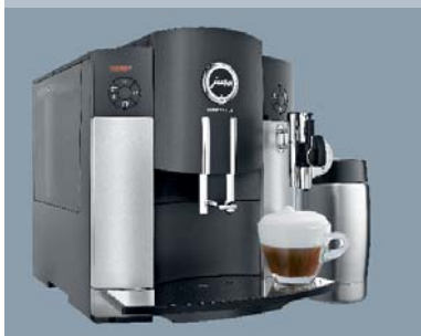
Classic compact design