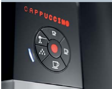
The direct route to enjoyment