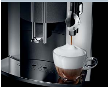
Cappuccino at the touch of a button